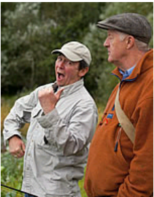
Paul Whitehouse and Chris Tarrant